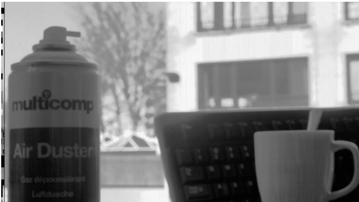
First HDR+GS image